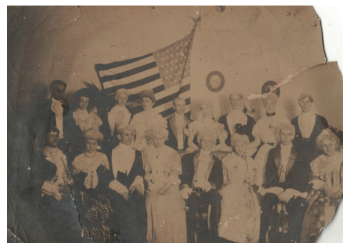
Pres. Washington's Birthday, 1906 • New Bern, NC.